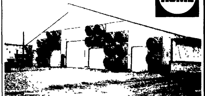
6-Row Free Stall Barn, Mt Joy, PA