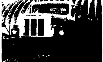
1974 INTERNATIONAL PAYSTAR 5000 Cummins 270 Engine RTP 9513 Transmission, IHC 44,000 Pound Rears, 315-80 22.5 Tires On Front 10.00-20 Tires On Back, Dayton Wheels, Flatbed With Crane Stock #1411 $4,900