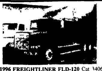
1996 FREIGHTLINER FLD-120 Cat 3406 E 435 HP with Jacob Brake RTO-16210 C Transmission, Air Ride Eaton DS-404 3.90 Ratio, 11R-24.5 Tires Pilot Wheels, Dual Stacks, 70 Inch Sleeper, 239 Inch Wheelbase Engine Man Have Had HP Increased $16,750