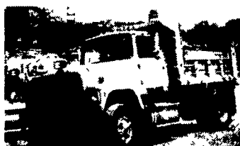
1988 FORD L-8000 DUMP 7.8 Ford Diesel Eng., Automatic, Single Speed Rear, 315/80/22.5 Tires On Front, 12R-22.5 Tires On Back, 10 Foot Steel Box, Stock #1380

'87 GMC 2500 HD 3/4 ton, 350 Fl, auto, PS, PB, 8,600 GVW, 58,000 miles, $2,250. 717-733-2873