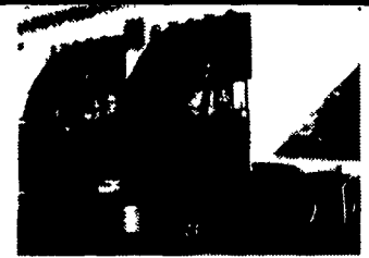
1993 MACK CH-613 DAYCAB TRACTOR. 300 Mack EM-7 Engine, RTX-14609B Road Ranger Trans, Eaton DS-402 4.11 Ratio Dayton Wheels, 22.5 Low Pro Tires, Rayco Suspension 365,000 Original Miles Price $15,600