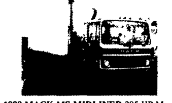
1988 MACK MS MIDLINER 205 HP Mack Renault Engine, 10 Speed Spicer Transmission, Single Speed Rear, 20 Foot Dry Van Body, 11R-22.5 Tires, Budd Wheels, Mileage 183,867, Stock #1313, 33,000 GVW $7,900