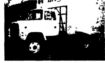
1993 FORD L-9000 DAYCAB Cummins L-10 330 HP, 9 Speed Transmission, Rockwell 40-145 3.91 Rear Ratio, Hendrickson 4 Spring Suspension, 174 Inch Wheel Base, 295/75/22.5 Tires, Pilot Wheels, Headache Rack $9,900