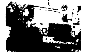
1980 INTERNATIONAL S-Model, IHC 404 Gas Engine, Auto Transmission, Single Speed Rear, 10.00-20 Tires, Dayton Wheels, Steel Dump Body, Stock #1406 $2,000