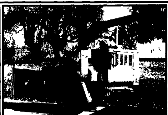
89 Eager Beaver 10" Chipper Model 200 1,300 hrs. Auto feed, JD Diesel good cond. $7,500 OBO 610/269-3442

2 Cobra frame type dump trailers, 33 foot steel frames, 32 foot aluminum beds with 2 way tailgates and coal doors. Tandem spring ride with 3rd axle air up and air down. Dayton 24.5 tubeless tires, 1989 with roll tarp, 1987 with mesh tarp. $13,000. ea (717) 624-2133 ask for Roger or Steve