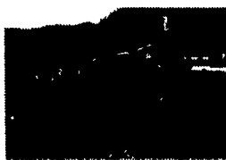
Micro Pivot from Hydrus