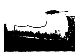
Balzer 4800 gallon Topfill Truck Tank Hyd. drive, Hyd. top lid, Exc. shape, 2 yrs old 070-mau $8,500