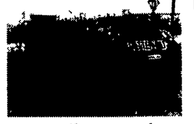
Better Built 1500 gal. Truck Tank Top fill 074-mau $750