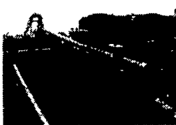
Houle 32' Lagoon Pump As-is condition 073-mau