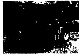
AgriChopper Round Bale Chopper All hydr. controls. (Boy sold separately) 064-mau