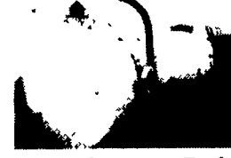
2500 gal. Vacuum Tank For Truck w/o Vacuum Pump 071-mau