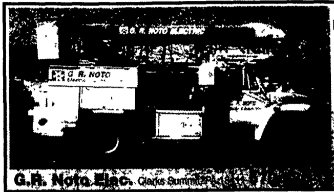
Powers Pole-Master Bucket Truck 42' Working height, S Series Model, 1900 Int'l, Truck With Cat 3208 Diesel, And Allison Auto Trans, Air Brakes, 60,000 Miles $29,500