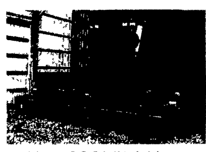
CA/IH 8850 Disk Mower $39,900.00

JD 6850 SP harvester, 6-row corn head, 3 meter p/u, 800 hrs. @ head — CALL FOR DETAILS