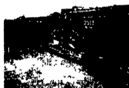
Gehl Lagoon Pump 068 mau