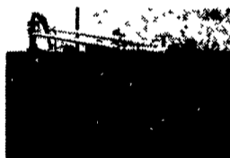
New Houle 42' Multi-Purpose Lagoon Pump 034-mau