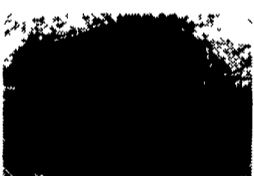
Houle Used 5,250 Gallon Spreader 059-mau