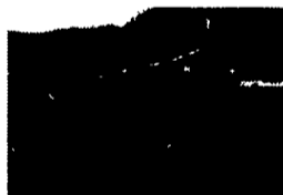
Micro Pivot from Hydrus