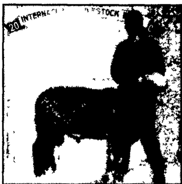
2001 Columbia junior breeding champion ram, Travis Crouse, Sycamore, Pa.