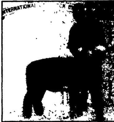
2001 Columbia junior breeding champion ewe, Travis Crouse, Sycamore, Pa.