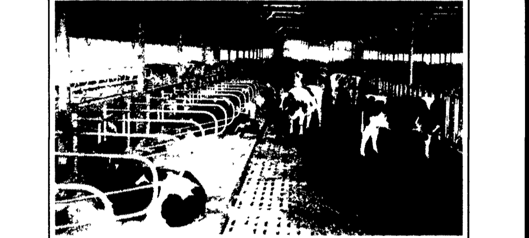
Long Core Cattle Waffle Slats