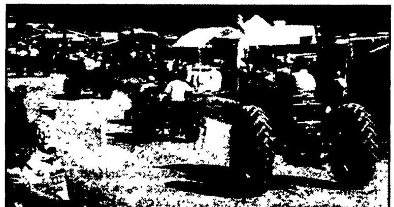
Tractor enthusiasts were delighted to see 226 antique tractors at the show.