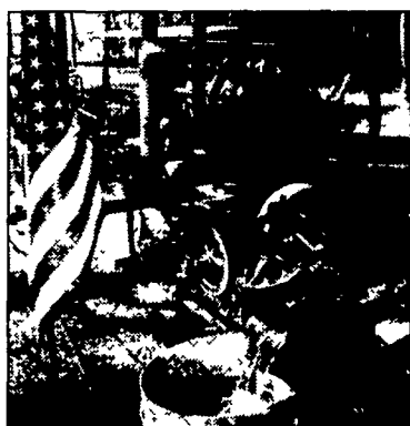
A permanent museum is desired to showcase antique tractors and steam engines.