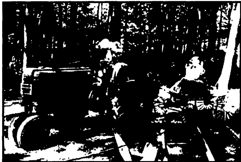
The ride may be a bit bumpy, but the novelty of riding in a cart hitched to an antique tractor appealed to many.