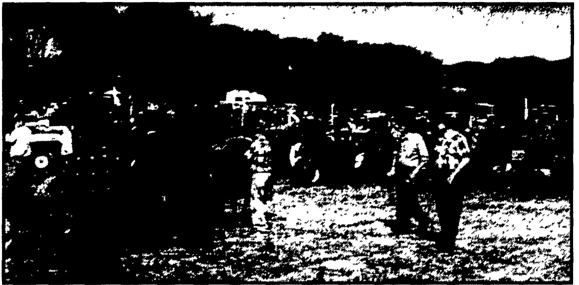
Photos above and below show that both tractors and old-time farm equipment enthusiasts were numerous at the 11th annual Southern Cover Power Reunion.

"Our long term goal is to have a permanent museum," Tom emphasizes.