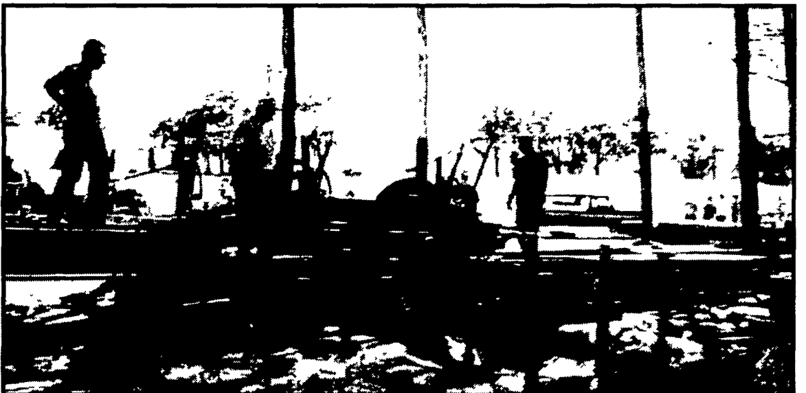
Steam power is used to cut these logs.