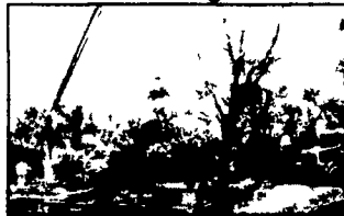
Placing Concrete On Site

Take the questions out of your new construction. Call Balmer Bros. for quality engineered walls.