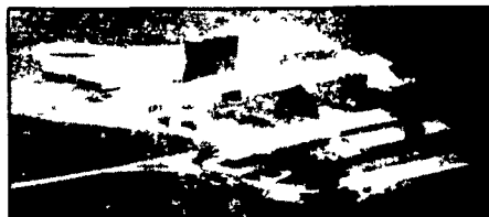
Far Left: 1-Million Gallon Circular Manure Storage Tank Far Right: 2 Silage Pits In-Barn Manure Receiving Pit

17 Years Experience In Pouring Concrete Manure Pits!