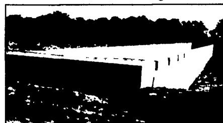
300' Long Manure Pit For Hog Confinement