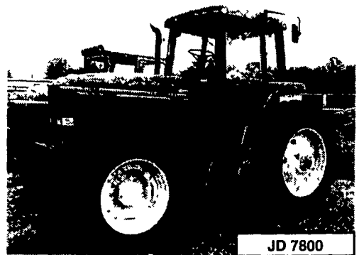
JD 7800 2,838 Hrs.; 145 HP; MFWD; Powershift Trans.; Exc. Cond.; $56,000