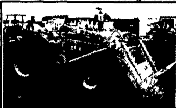
IH 2404 w/Loader Runs Great