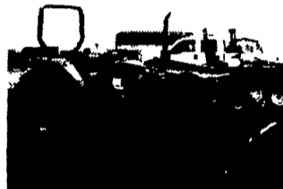
Kubota L2850 4x4, w/Loader, Low Hrs., Ex. Cond. (2) JD "H" Tractors 1 - Completely Restored