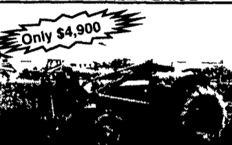
IH 404 w/Loader Runs Great