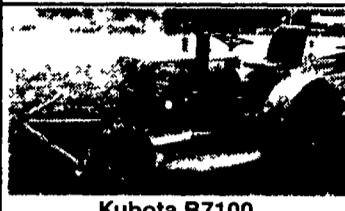
Kubota B7100 HST, Equipped for Mowing in Christmas Trees