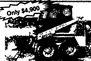
Mustang 342 Skid Loader w/Kubota Engine