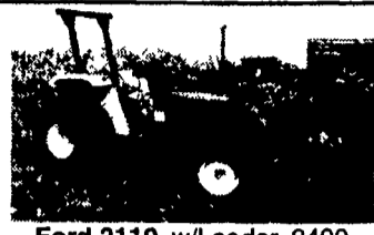
Ford 2110, w/Loader, 2400 Hrs., Needs Paint, Call For QUICK SALE PRICE

CONSIGNMENTS ACCEPTED We Are 1/2 Hour From Harrisburg / 1/2 Hour From Reading / 45 Min. From Allentown