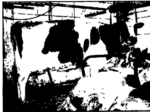
Liz-Lee Marlin Belfast 12-21-94 Classified Excellent