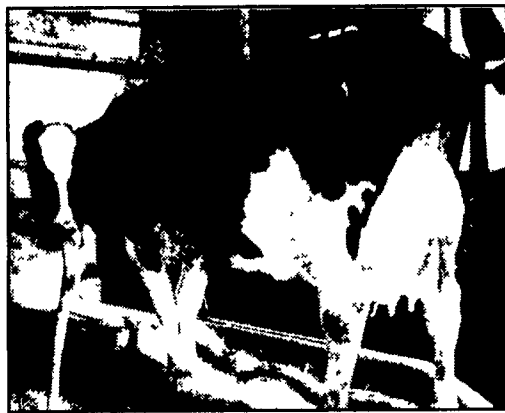
King Ridge Alicia Emory 1-11-96 Top Producing 5 Yr. Old Reg. Holstein Classified Excellent