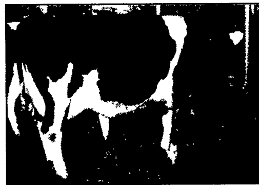
Liz-Lee Dynamic Oscar 7-7-93 Classified Excellent