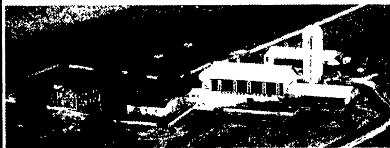
140 Kreider Road, Myerstown, PA

DIRECTIONS: From Myerstown take Rt. 422 East 1 3 miles east of Rt. 501, turn left onto Martin Road "at Dutchway Market", go 1 mile to Kreider Road and turn right to 1st farm on right, Jackson Township, Lebanon Co., PA.