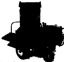
FARMWAY BEDDING CHOPPER