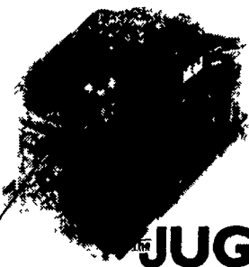
No balls, flaps, or lids to get in the way