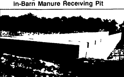
300' Long Manure Pit For Hog Confinement