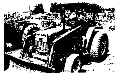
JD 1070 4wd ldr. 1 remote canopy 2250 hrs. CALL