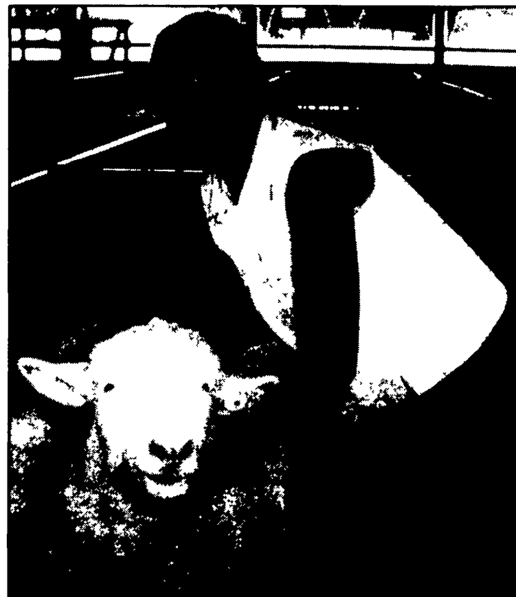
Kelsey Binkley shows the supreme champion breeding ewe.