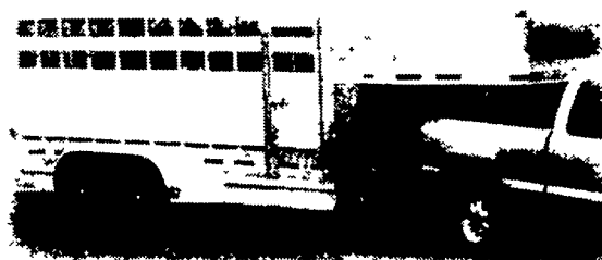
16' L x 6'5" W x 6'6" H Gooseneck also available in 7' height

The versatile, light-weight and affordable Maverick LS Series has been introduced to provide the small to mid-size farm and livestock operations with the benefits of Eby all-aluminum construction. These models feature a reduced width (6'5") for improved visibility and handling—they are designed to be pulled with lighter duty trucks or SUVs.