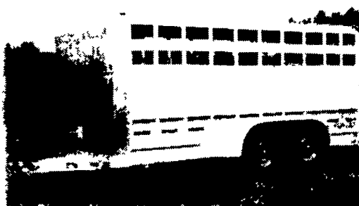
16' L x 6'5" W x 6'6" H Bumper Hitch also available in 7' height

Engineered for durable performance for a wide range of livestock, these trailers are built without compromising Eby's standards.