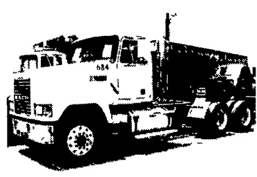
1997 Mack CH 613 Tandem Truck Tractor

427 H P Mack, 10 spd Fuller Trans, 38K Rears on Air Ride, 12K FA 204 WB Dual Exhaust, Wet kit, New PA Inspection