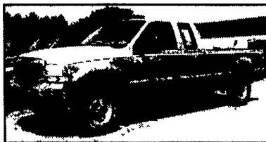
99 FORD F250

Quad Cab XLT, 4x4, Long Bed, 7.3 Power Stroke Diesel, 6 Sp, A/C, PW, PDL, Cas, Cruise, Tilt, 3.73 Rear, 8800 GVW, Sandstone, 27,000 Mi