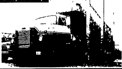
1976 IH 20' Tandem Dump

38K Rears on Hendrickson Susp, 12K FA, DT466 Turbo Diesel, 13 Spd Fuller Trans, 20' Eby Aluminum Body, w/4' Removable Alum Sidekit Runs Good, PA Insp