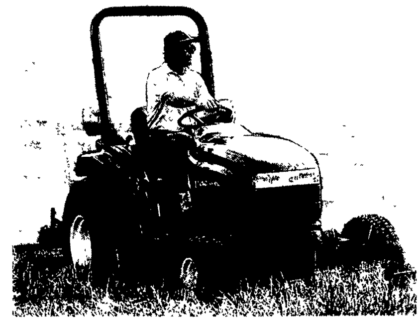
With an innovative sloped-hood design and sleek styling, Boomer compact tractors set new standards for efficiency, maneuverability, and versatility.