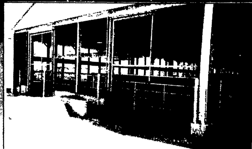
Total Curtain Gable Wall