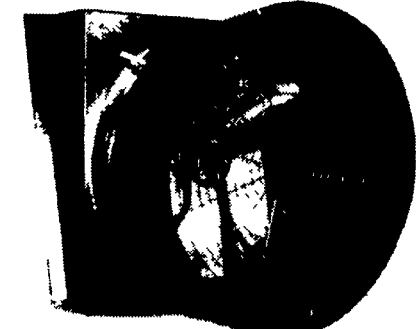
Economical High Performance Fan Galvanized Steel Housing