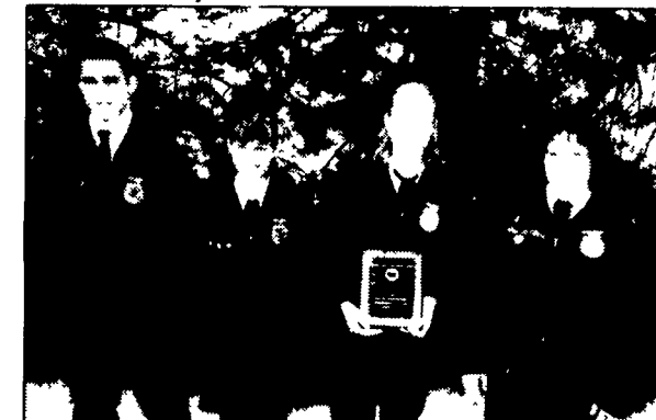
First place chapter winner for Scrapbook: Walter B. Saul High School, Philadelphia.