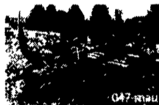
Houle 12' Super Pump w/ Twin Nozzles