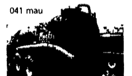
Husky 3,000 Gallon Vacuum Tank