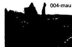
Totally Rebuilt Houle 10' Super Pump on Trailer