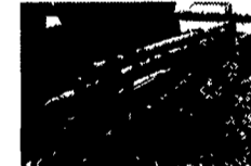
Clay 20' Lagoon Pump w/ 4" Piping