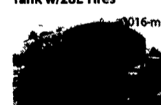
2000 Houle 5,250 Gallon Spreader