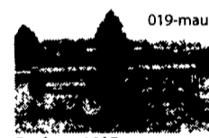
Badger 10' Pump on Trailer