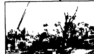
Placing Concrete On Site

Take the questions out of your new construction. Call Balmer Bros. for quality engineered walls.