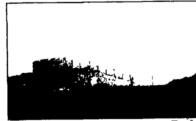
Above Ground Liquid Manure Tank 425,000 Gallons