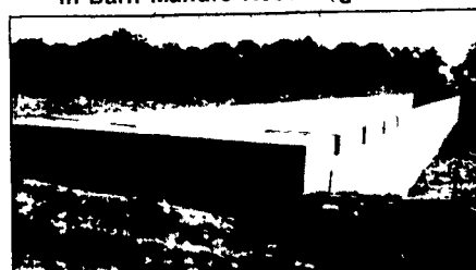
300' Long Manure Pit For Hog Confinement