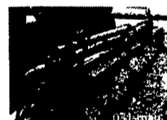
Clay 20' Lagoon Pump w/ 4" Piping