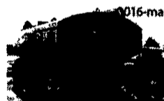
2000 Houle 5,250 Gallon Spreader