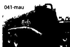
Husky 3000 Gallon Vacuum Tank