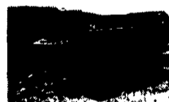
New Idea Sidekick Spreader: (1) 3229, (1) 3222