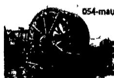
Used Irrigation Reels Available