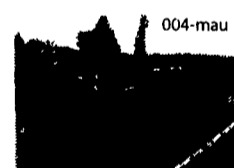
Totally Rebuilt Houle 10' Super Pump On Trailer