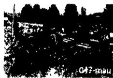
Houle 12' Super Pump w/ Twin Nozzles