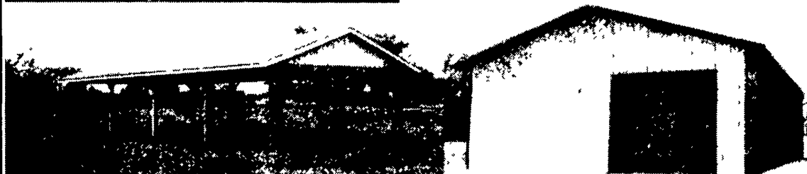
* Pole shelter shown