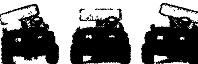
A new all-purpose vehicle...with a twist

Experience the Twister for yourself at one of these "full service" dealers today!