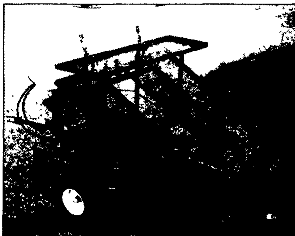
The most versatile water wheel transplanter for planting vegetables into plastic mulch.