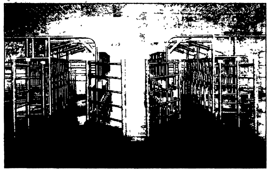
Double 12 DeLaval/Blue Diamond G.E.G.I. Parallel Parlor, featuring: