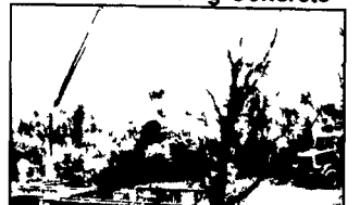
Placing Concrete On Site

Take the questions out of your new construction. Call Balmer Bros. for quality engineered walls.