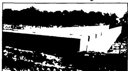
300' Long Manure Pit For Hog Confinement