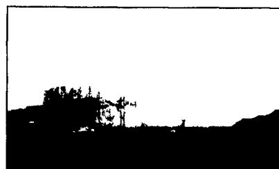
Above Ground Liquid Manure Tank 425,000 Gallons