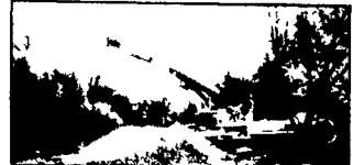
92' Boom Placing Concrete