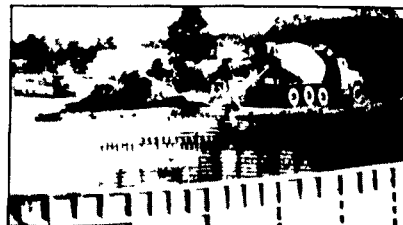
Construction Of Partially In-Ground Liquid Manure Tank - 400,000 Gallons