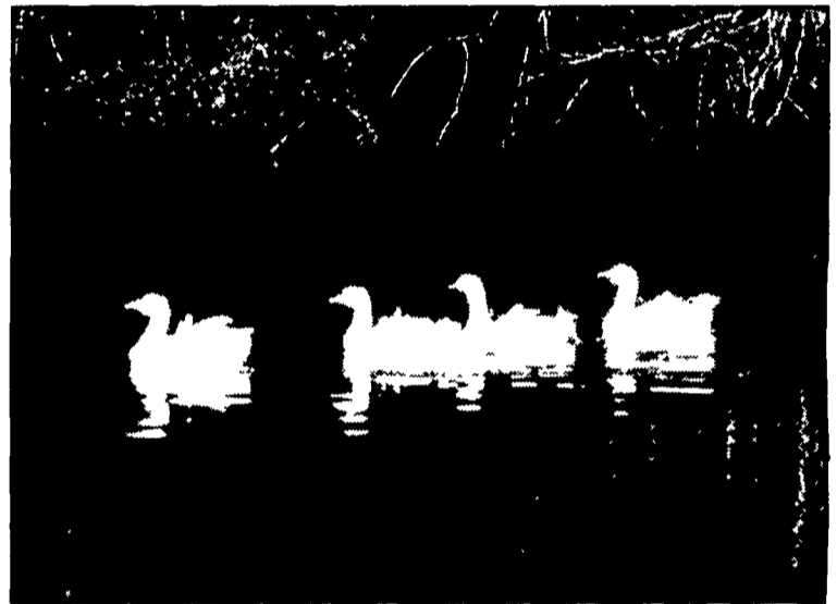
Even the geese celebrate springtime with a leisurely swim.