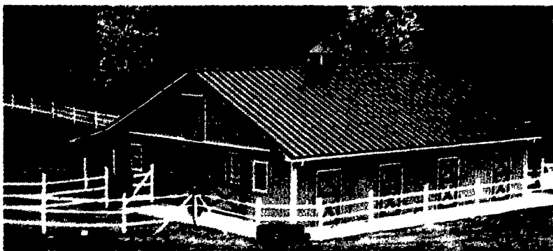
Complete Building Packages, Trusses And Glue-Laminated Timbers