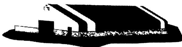
"Our Best Building"