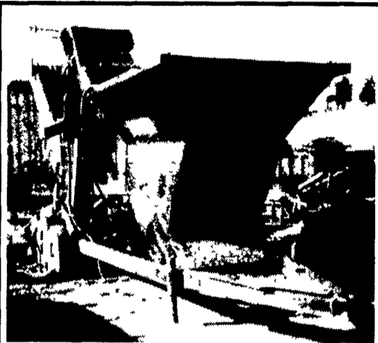
1-365 Royer Shredder Brand New John Deere Powered Motor with Top Grate and Trash Conveyor 717-438-3354