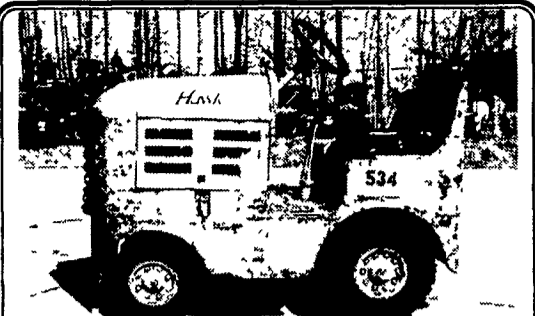
Clark Tow Tractor , 2,600 lb. Draw Bar Pull, 4 Cylinder Continental Gas Engine, 3 Speed Standard Transmission, Pneumatic Tires 215/957-6066

Forklifts- Must liquidate many makes. Call 1-888-440-LIFT (5438)