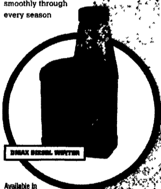
Available in 1 gal. and 8 oz. sizes