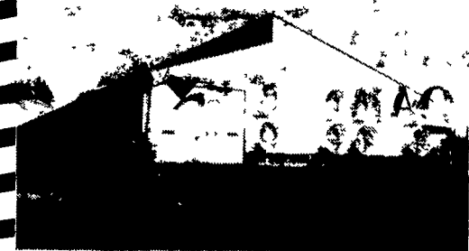
Free Stall Barn, Robesonia, PA