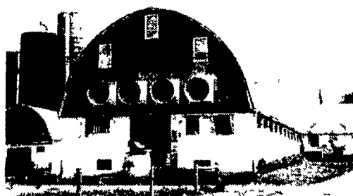
Tie Stall Barn, Myerstown, PA

ATTENTION FREESTALL & TIE STALL BARN OWNERS!