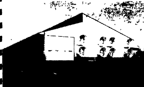
Free Stall Barn, Robesonia, PA