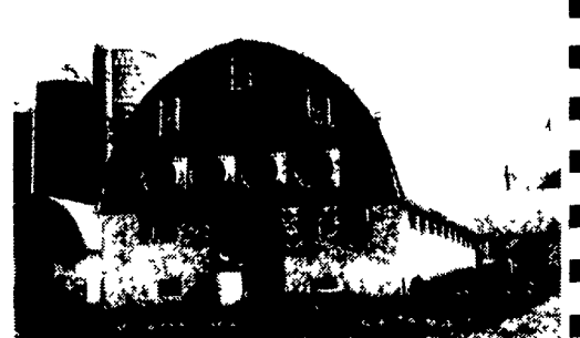
Tie Stall Barn, Myerstown, PA