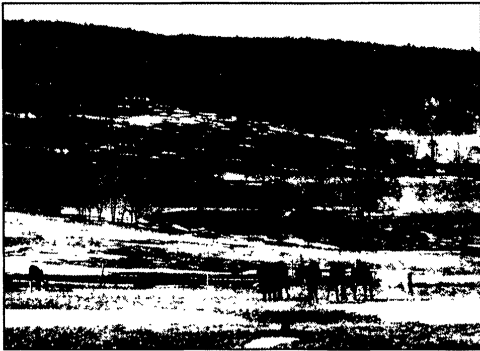
Calves and heifers have access to pasture from a very young age. Milking cows have access to pasture from mid-April through October.