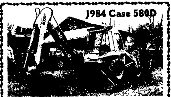
1984 Case 580D

Komatsu D65E-8, SS# 45495, enclosed ROPS, tilt blade, 8000 hrs, vg U/C, vg cond, 1-owner. 609-298-2243