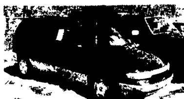
94 MERCURY VILLAGER LS Fully Equipped, #R4662A $5,995