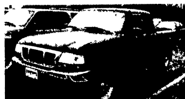
99 FORD RANGER XLT SUPER CAB 4x4 16,000 Orig. Miles, #P4694 $18,995