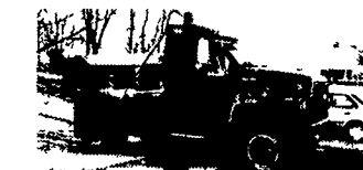
95 CHEV KODIAK 9 FT. DUMP 366 Allison AT PS PB 25,900 GVW 46,000 Miles - 2 To Choose From