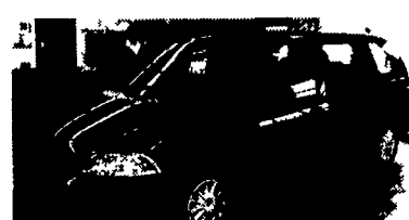
00 WINDSTAR LX 7 Passenger, Fully Equipped #R4660 $17,499