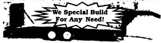
21' Low Profile, 10,000#, axel w/easy lube, elect brakes, pressure treated deck, 10,000# G V.W., gooseneck $3,100 Bumper pull $2,950