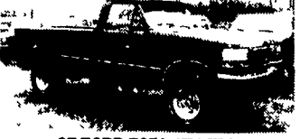
97 FORD F350 4x4 XLT Power Stroke Diesel AT A/C, Most Options CD Player Alum Wheels 63,000 Miles Blue - Must See #F1013