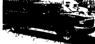
94 FORD F350 CREW CAB DUALY 7.3 Diesel, XLT, 5 Spd., A/C, Most Options, 148,000 Miles, Black #F984