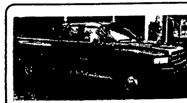
95 DODGE RAM 3500 CLUB CAB DUALY 4x4 Cummins Turbo Diesel, AT, A/C, Laramie SLT - Most Options, 61,000 Miles, Red - #D347 VERY NICE TRUCK