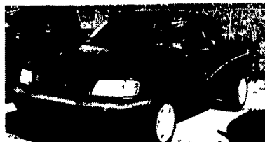
97 ISUZU HOMBRE PICKUP 59,000 Orig. Miles, A/C, Stereo, #1063A • $6,995