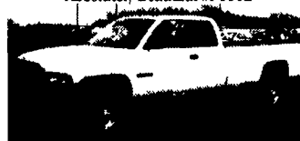
99 DODGE RAM 2500 CLUB CAB 4x4 Cummins Turbo Diesel, AT, A/C, AM/FM/Cass, 51,000 Miles White #D335