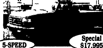
97 FORD F250 4x4 Power Stroke Diesel, 5-Spd., AC, 8,600 GVW, AM/FM, 88,000 Miles, Green #F1008