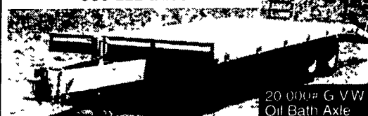
20,000# G V.W. Oil Bath Axle 10K Dual Tandem Trailers - Spring Assist Ramps Pintle Pull, 18x5, Dovetail $4,750 Gooseneck, 20x5 $5,000