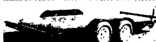
16' Car Hauler, diamond plate deck with W/D rings, self storing ramps, 7,000# G V.W., elect. brakes, both axels 82" between wheel wells, breakaway kit incl 16' Car Trailer $1,495 18' Car Trailer $1,645