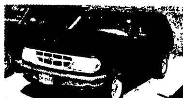
97 FORD EXPLORER XLT 48,000 Orig. Miles, Black Beauty, #P4794 $15,995