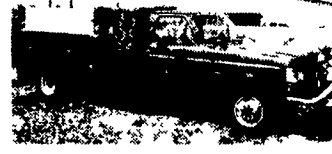
87 FORD F350 L-PAK DUMP Power Angle Plow, 460 V8, 4 Spd., 57,000 Orig. Miles, Blue