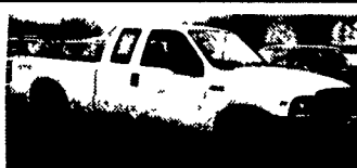
99 FORD F250 QUAD CAB 4x4 V10 AT A/C XL Trm. 41,000 Miles White #F1017

2400 E. Cumberland St. Rt. 422 Lebanon, PA 17042 717-273-7995