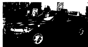
2000 MUSTANG CONVERTIBLE V6, AT #P4737 $21,499