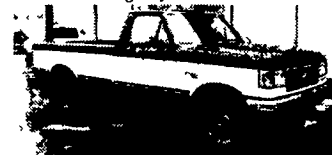
91 FORD F250 4x4 7.3 Diesel, 5 Spd, PS, PB, A/C, 77,000 Orig. Miles, White & Blue, Ex. Cond. #F1000