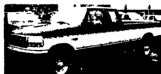
97 FORD F250 SUPER CAB XLT 4x4 Power Stroke Diesel AT, A/C, Most Options, 51,000 Miles Green & White, #F1009