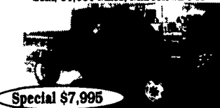
96 FORD F350 CONTRACTOR DUMP 5 Spd., 351 V8, PS, PB, 103,000 Miles, Red Ready To Work #999