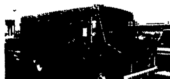
84 CHEV 14 FT. STEP VAN 30 Series, 4 Spd., 35,000 Miles, Blue, 6cyl