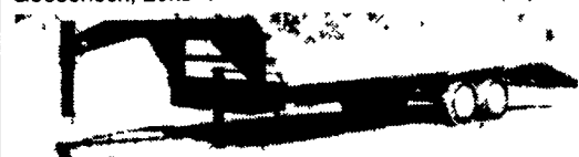
24' Gooseneck, 4' dovetail, 1-12,000# G V.W, 6,000# axels w/easy lube, electric brakes, 7 50-16 tires, breakaway kit, ramps w/pressure treated deck, standard 12,000 GVW $2,995 14,000 GVW $3,195