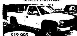
94 CHEV 2500 4x4 H.D. 6.5 Turbo Diesel, AT, A/C, 92,000 Miles, White, #C584