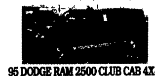
95 DODGE RAM 2500 CLUB CAB 4x4 Cummins Turbo Diesel, 5-Spd., A/C, Laramie SLT, Most Options, Tow Pkg., Air-Lift Suspension, Air Control Shocks, 6-Way Power Seat, 61,000 Miles, Maroon #D345