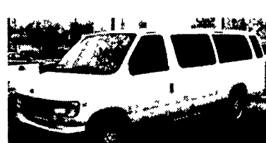
99 FORD E350 15 PASSENGER VAN V8, AT, A/C, #R4657 $22,995