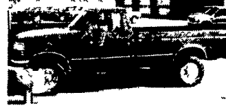
96 FORD F250 XLT 4x4 Power Stroke Diesel, AT, A/C, Most Options, 77,000 Miles, Alloy Wheels, Red, Absolutely Beautiful #F1002