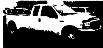
99 FORD F350 QUAD CAB DUALY 4x4 XLT, Power Stroke Diesel, 6-Spd., A/C, Most Options, CD Player, Alloy Wheels, 19,000 Miles, White, #F983