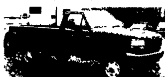
97 FORD F350 REG. CAB 4x4 Power Stroke Diesel, XL Trm, AT, A/C, AM/FM, 47,000 Miles, Dk Green #F982