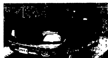
00 FORD EXPEDITION EDDIE BAUER Leather, Moon Roof, Fully Equipped, CD Player, #P4795 MUST SEE!