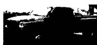
99 DODGE RAM 3500 DUALY 4x4 QUAD CAB V10, Sport Pkg., AT, A/C, Most Options, 48,000 Miles, CD Player, Blue #FD342