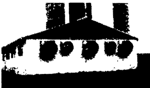
76 Cow Tie Stall Barn, Denver, PA