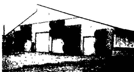
6 Row Free Stall Barn, Mt. Joy, PA