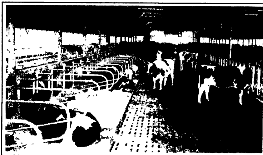
Long Core Cattle Waffle Slats