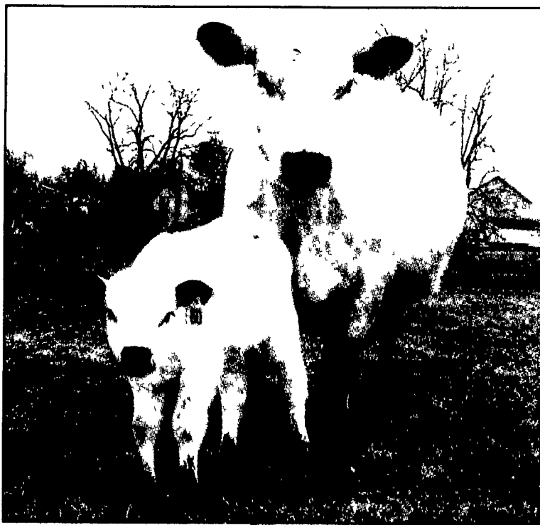
One of Wenger's favorite characteristics about the British White Park breed is their calm, even temperament.