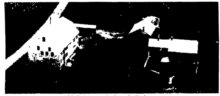
640 Schoeneck Road, Ephrata

DIRECTIONS: From Route 272 north of Ephrata turn onto Schoeneck Road go 1.7 miles to property on right. Lancaster Co., PA