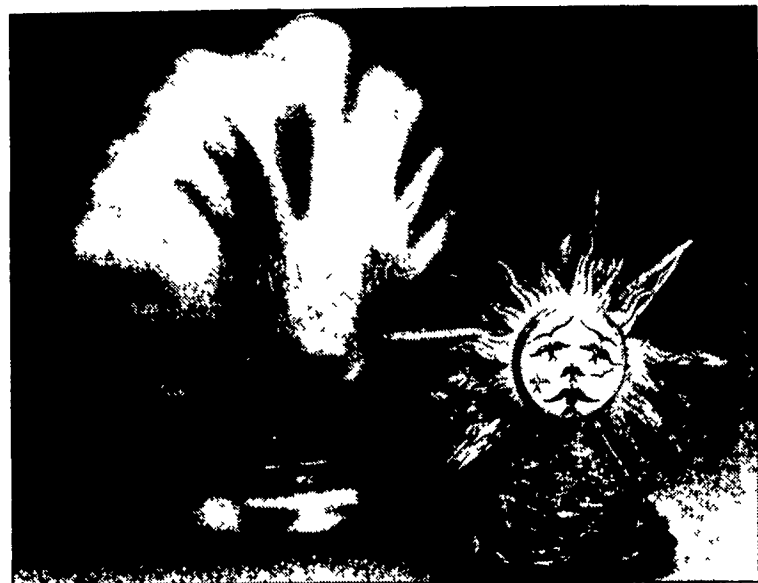
Perfume bottle "Le Roy Soleil," created by Salvador Dali for Schiaparelli.

Be picky. Look for the most unusual shapes, figural stoppers or forms. Miniatures often given away as samples in department stores are another possibility.