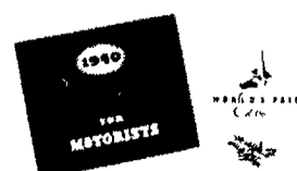
Pontiac World's Fair Catalog

3:00 P.M.: New Inventory - Tools - Hardware - Toys