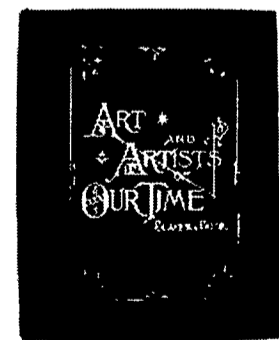
One of Several Turn Of The Century Art Books