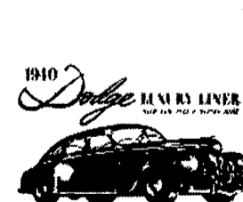
1940 Car Brochures